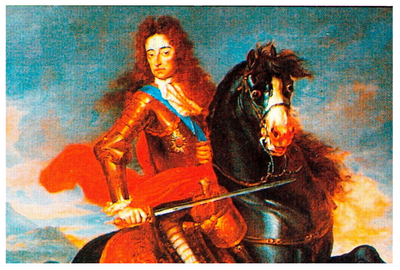
King William of Orange

Funding of up to €15,000 (£12,846) for each project was offered.