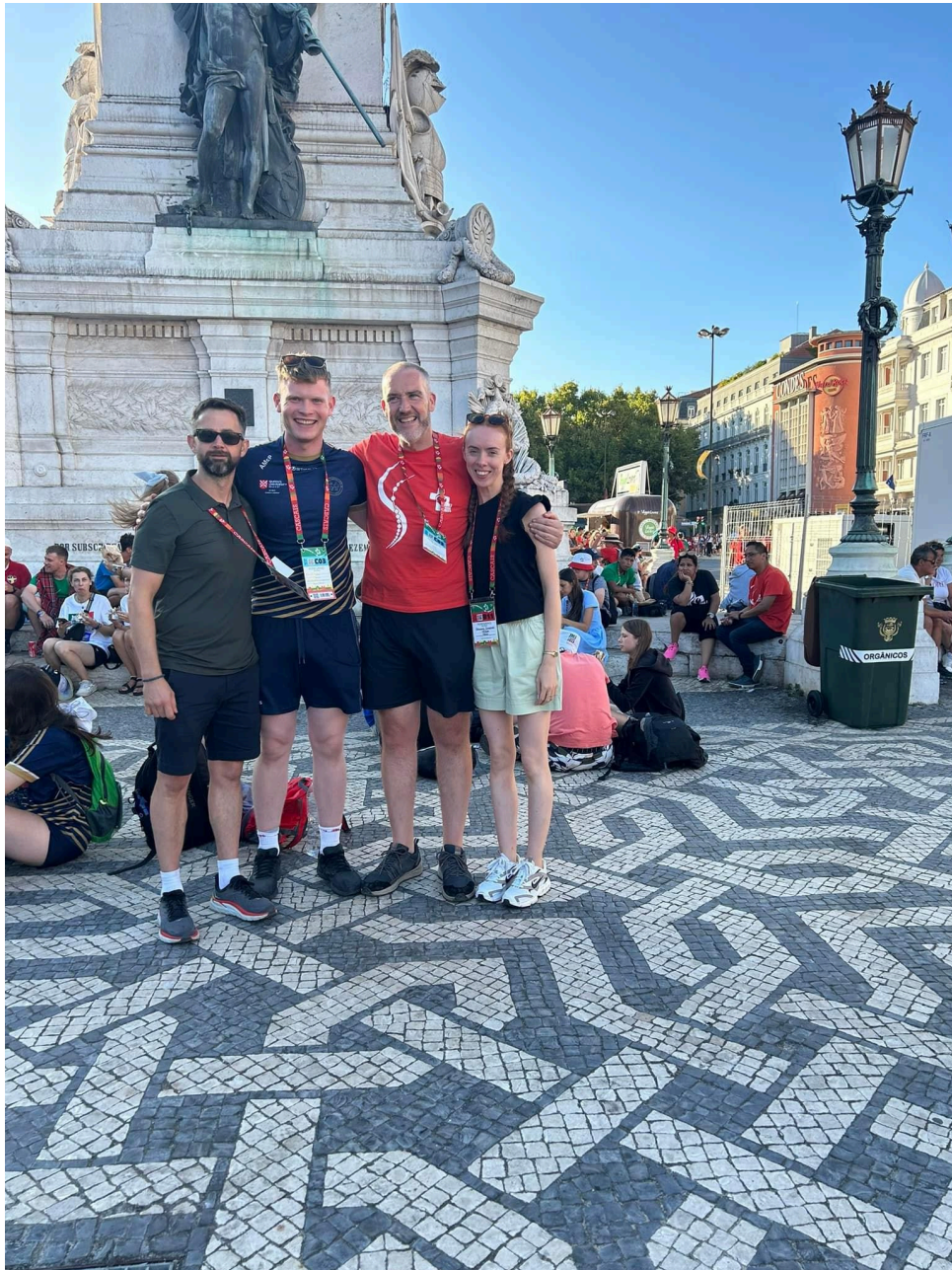
Image of the day – Queen’s chaplaincy at World Youth Day in Lisbon