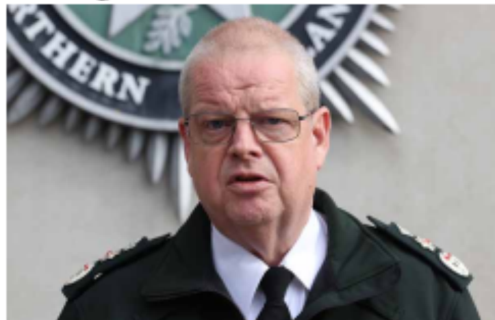
PSNI Chief Constable Simon Byrne during a media briefing at the force's headquarters in Belfast yesterday.

The PSNI chief's press conference followed an incident earlier yesterday,