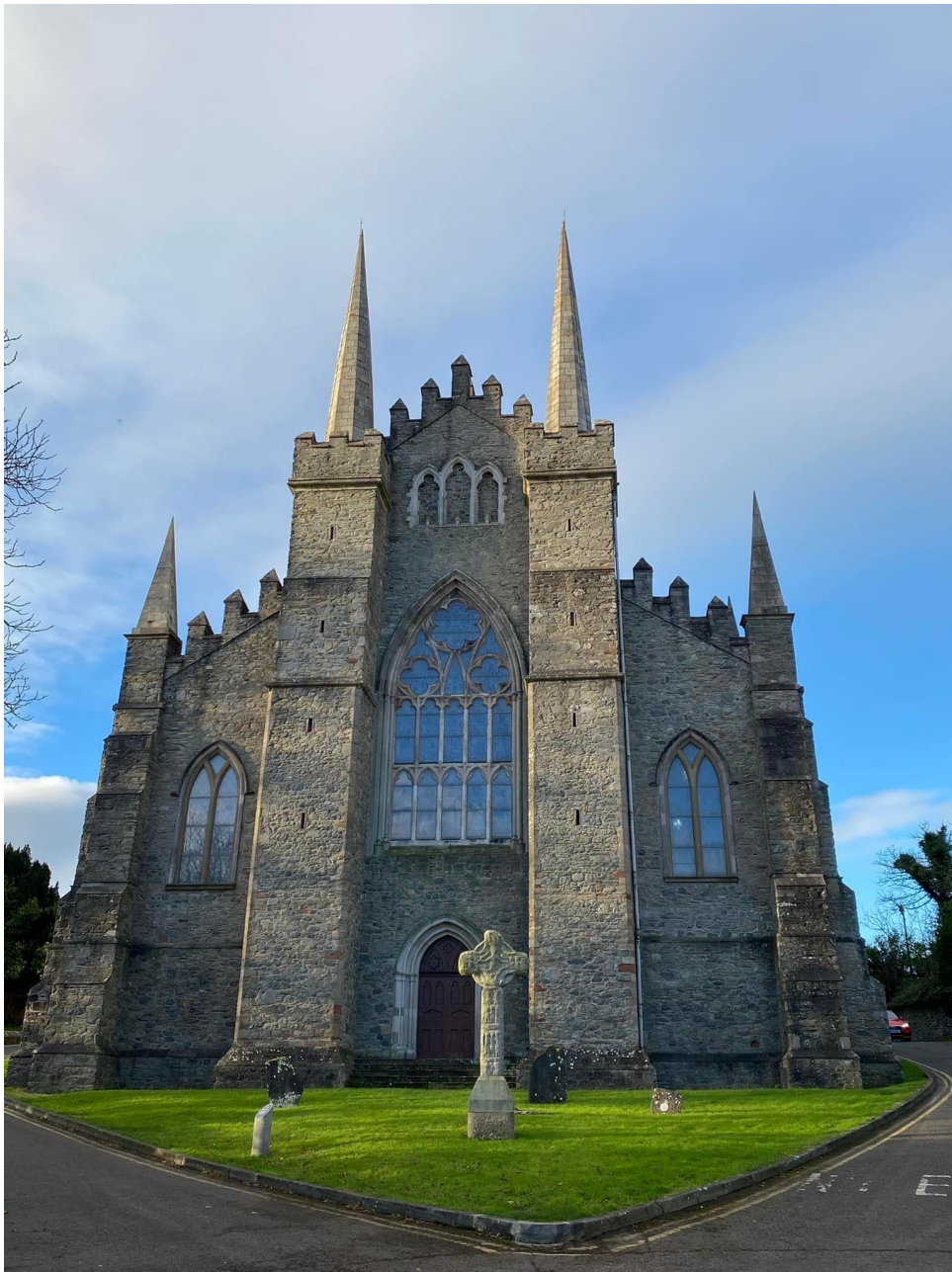
Image of the day - Down Cathedral