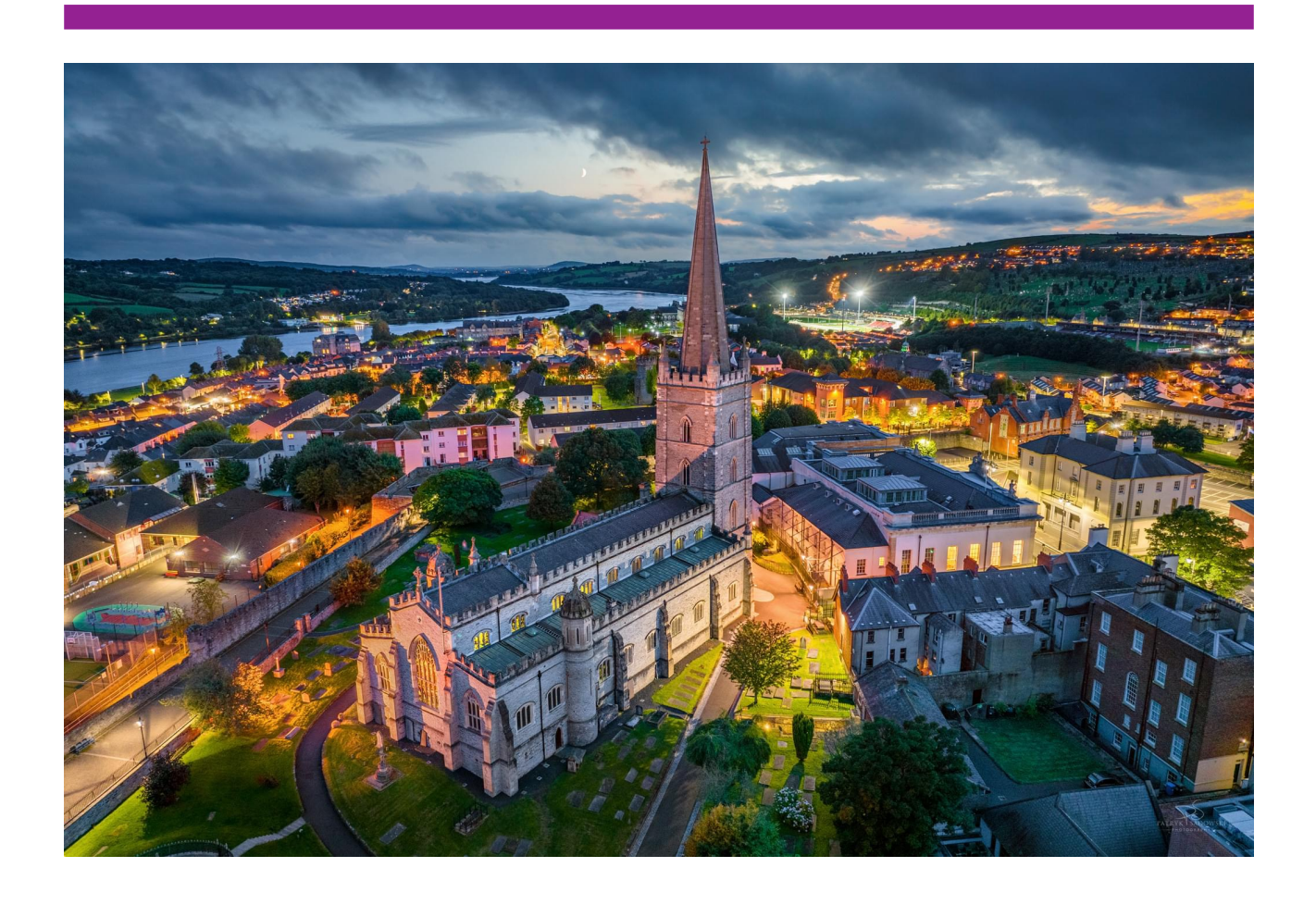
Image of the day – St Columb's Cathedral at dusk