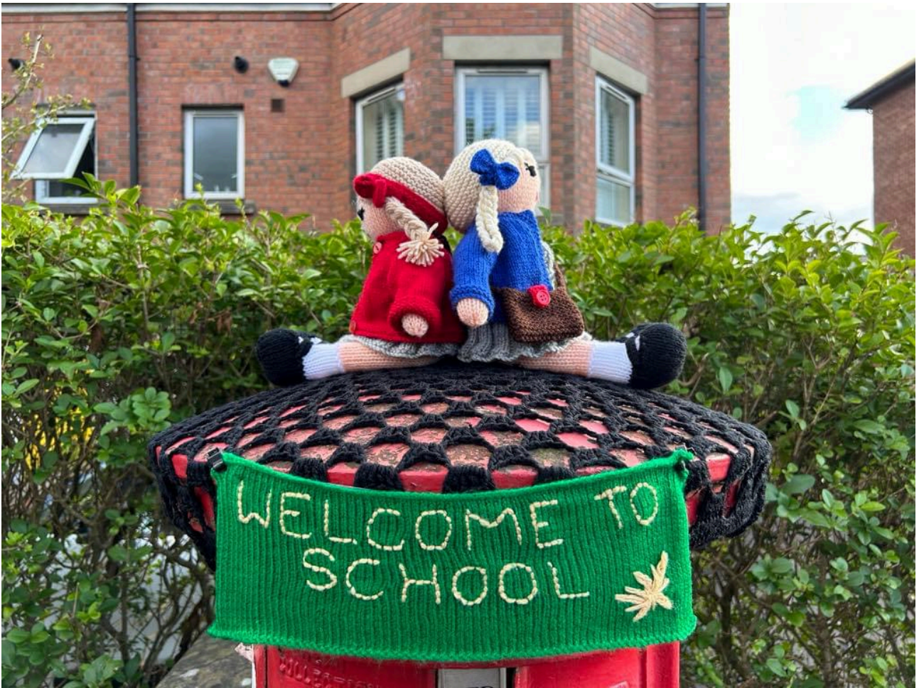
New topper near East Belfast school