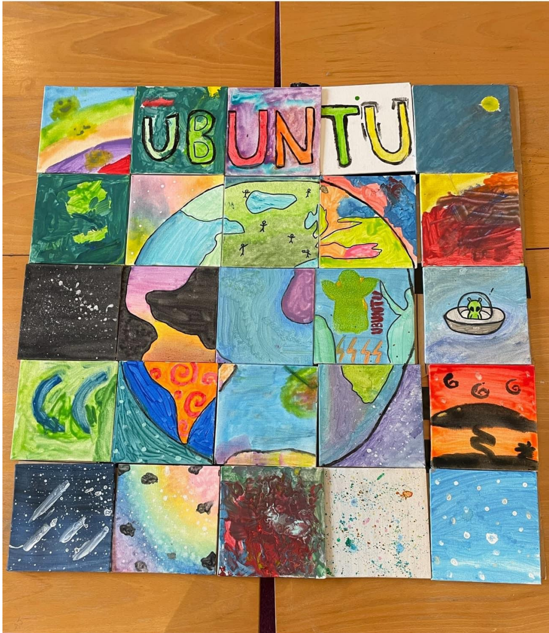
Image of the day - Ubuntu