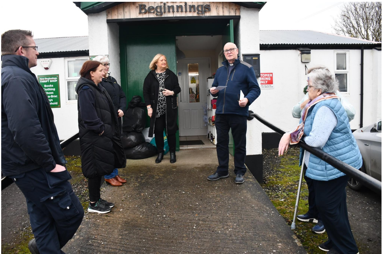
Image of the day – Eglinton parish thrift shop profits–share now a Christmas tradition