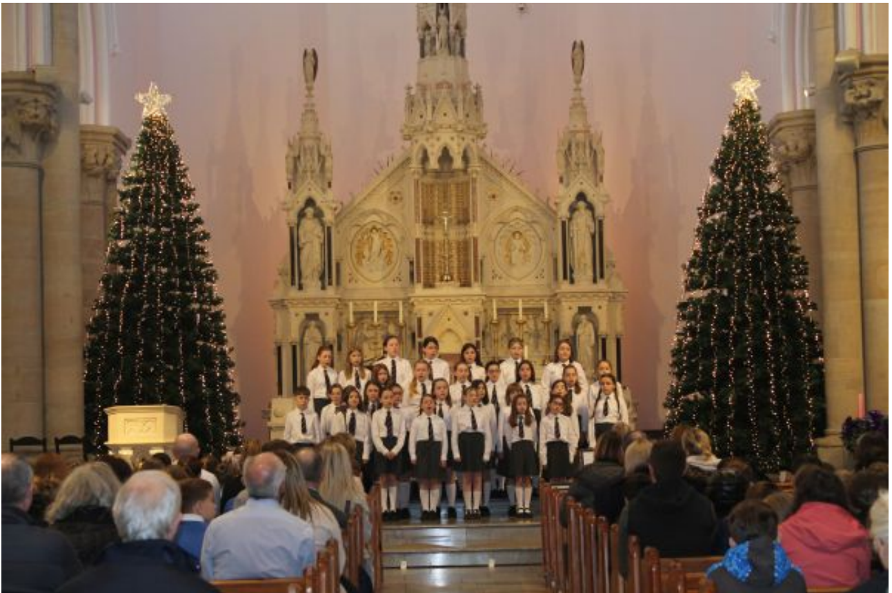
Some of the schoolchildren singing in St. Michael's Church.

“It provides something for everyone, and it can establish a real sense of shared identity and a new sense of participation, which is very important. This Carolfest seeks to play a part in expelling sectarianism and build peace and mutual understanding amongst our people.”