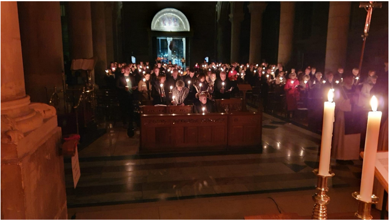
Advent candlelight procession in St Anne's Cathedral, Belfast