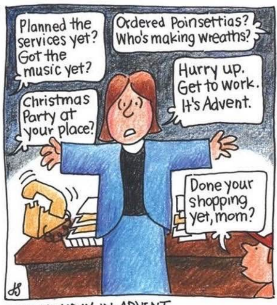
ONE MONDAY IN ADVENT