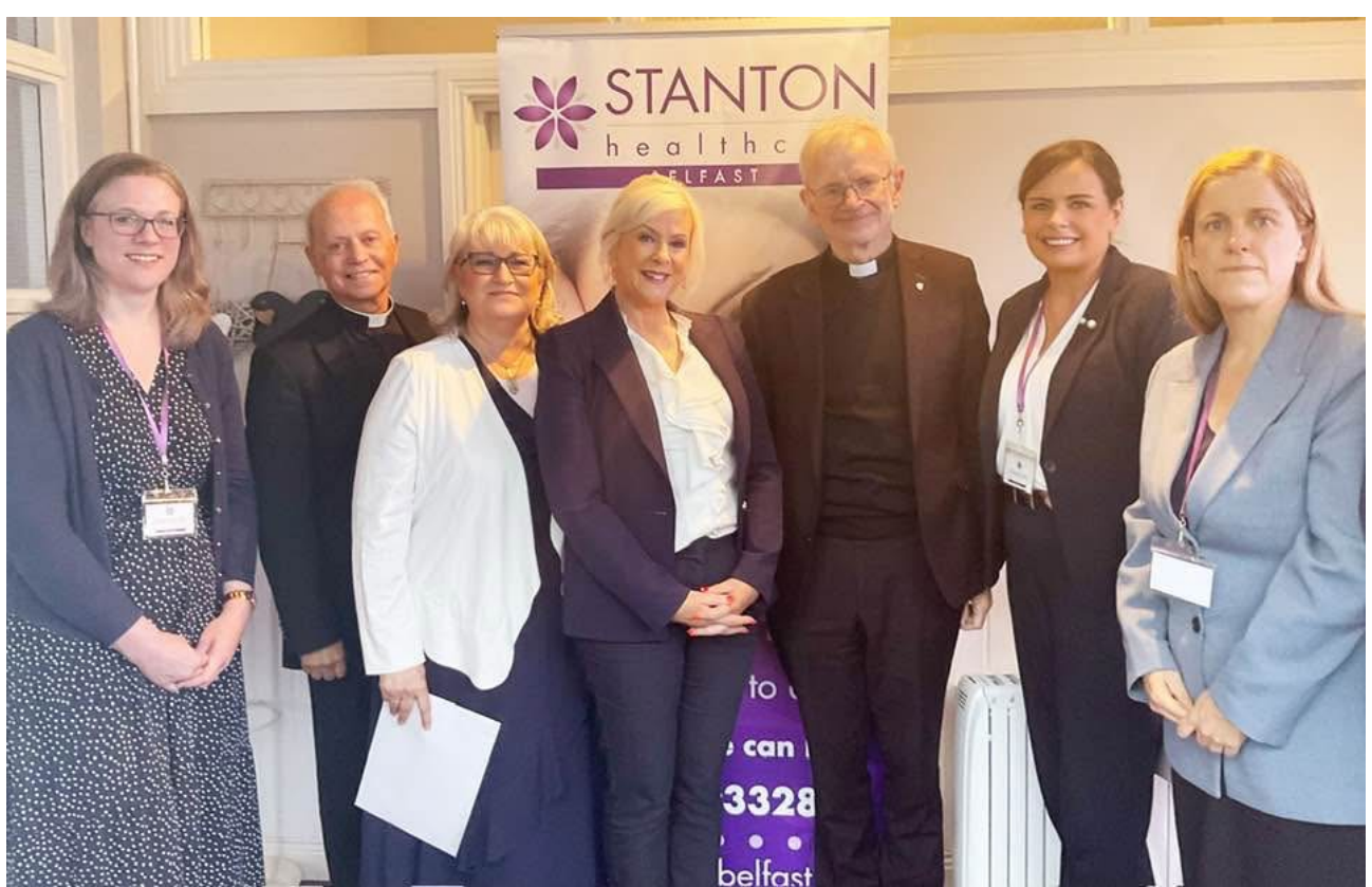
Bishop visits Stanton Healthcare

The church will remain open during those hours to allow space at a very busy time for all from the community to come in and spend a while in reflection/ prayer. "It would be great if you could support this venture. Thank you!"