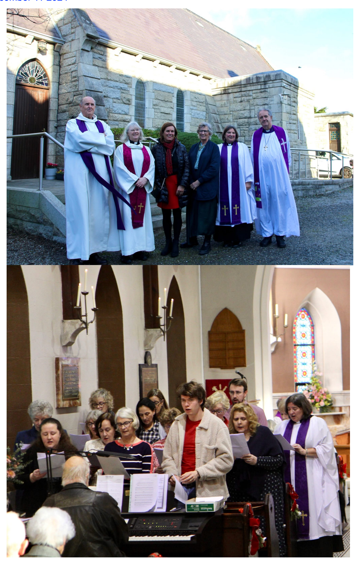
is herself connected to the church pointed out, the milestone