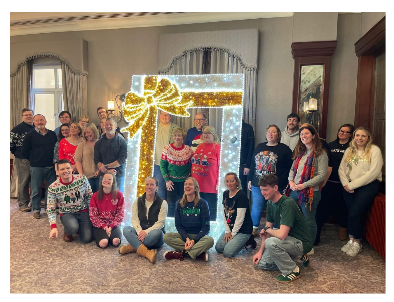
See pages 7 - 9 above. C of I and Methodist Church youth ministry trainers.