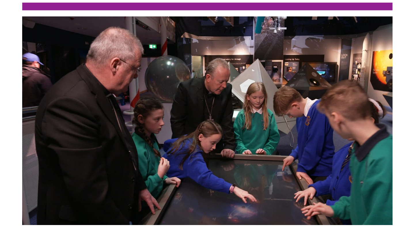
Image of the day – Archbishops star gaze for Christmas Day message