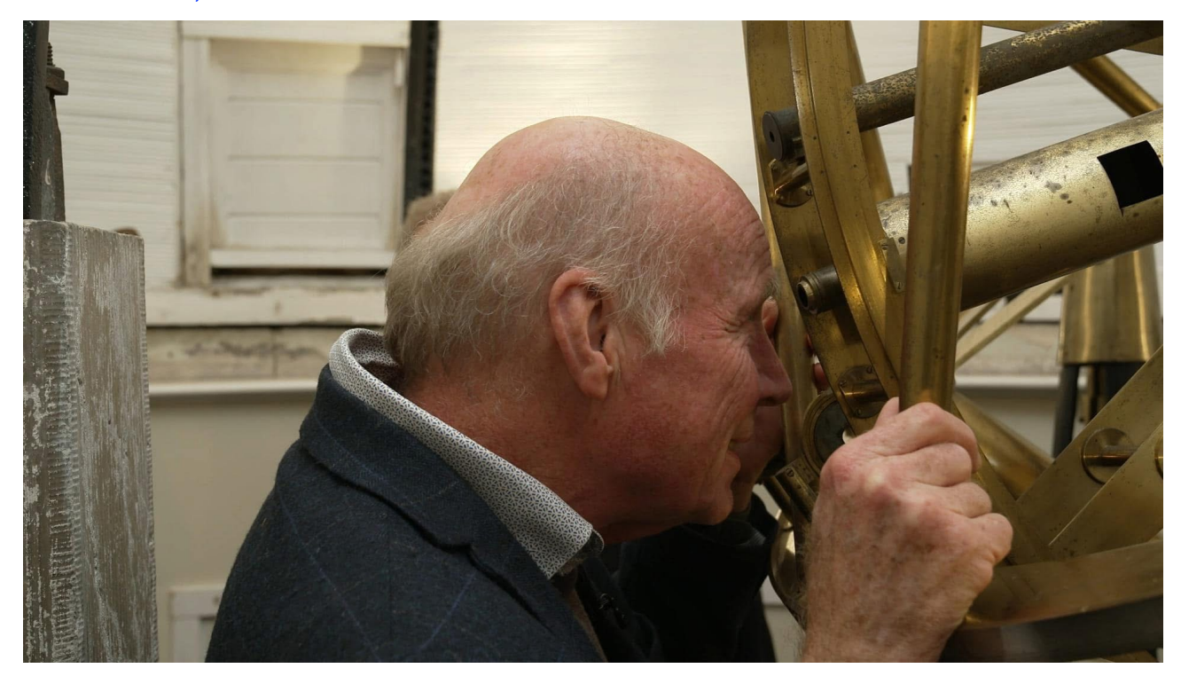
Day broadcast with the Archbishops of Armagh.

This year's Christmas message from the Archbishops of Armagh, which was filmed in Armagh Observatory and Planetarium and draws on the theme of the Christmas Star, will be broadcast on Christmas Day at 12.10pm on RTÉ One television and 1.05pm on RTÉ Radio One.