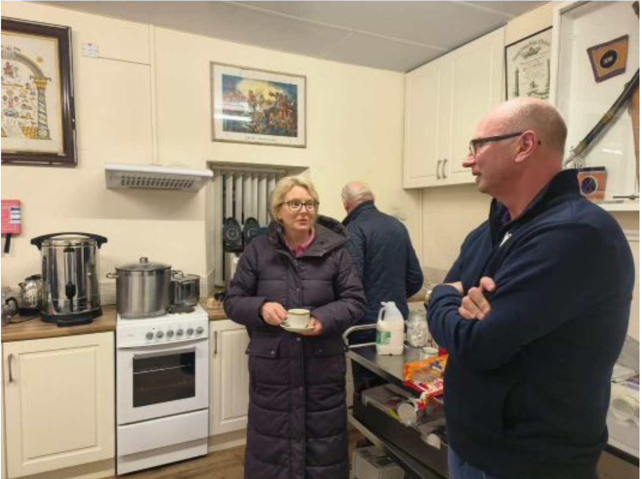
Plenty of tea and coffee being prepared at Trory schoolhouse

Storm Eowyn has caused destruction of property including buildings and trees and hardship to many people through loss of electricity and vital services.