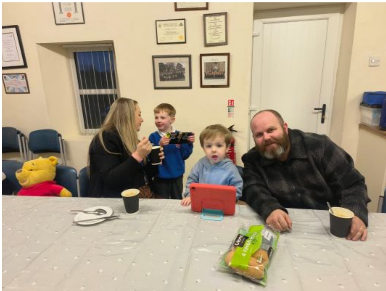
Adults and children availing of a homework hub and some refreshments at Trory Schoolhouse.