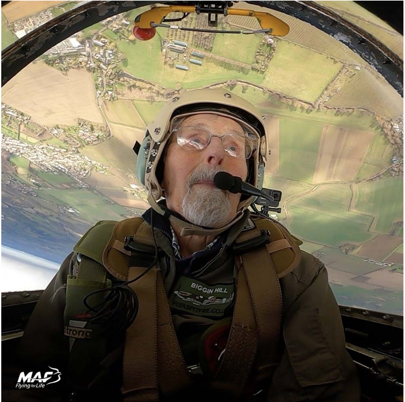
Image of the day – Final flight of Missionary Aviation Fellowship co-founder