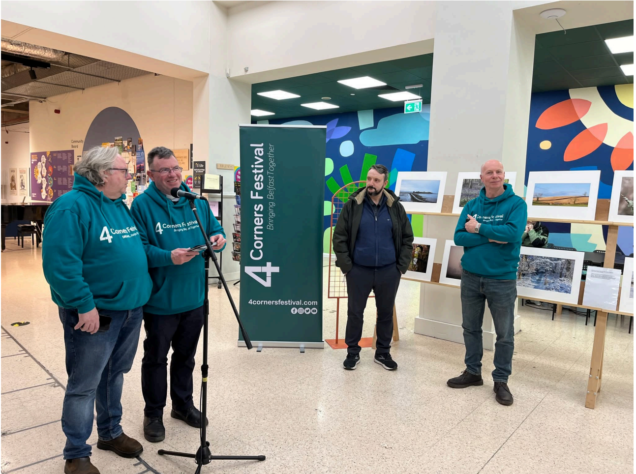
Image of the day - 4Corners In Conversation About Home