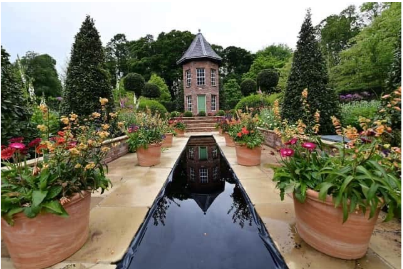
Antrim Castle gardens

There were 15 images, one from each of DEC's member charities, which covered the work from recent appeals including for Afghanistan, Ukraine, Pakistan and Turkey-Syria.