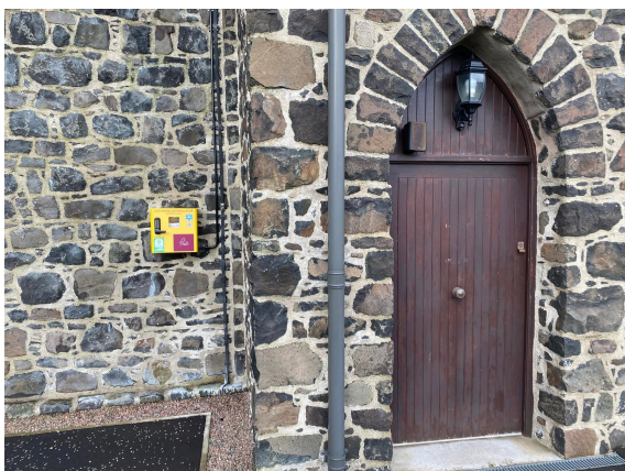
Church News Ireland

Have you see the new defibrillator installed outside St Paul's Church? It is situated to the left of the entrance and is connected to the national network.