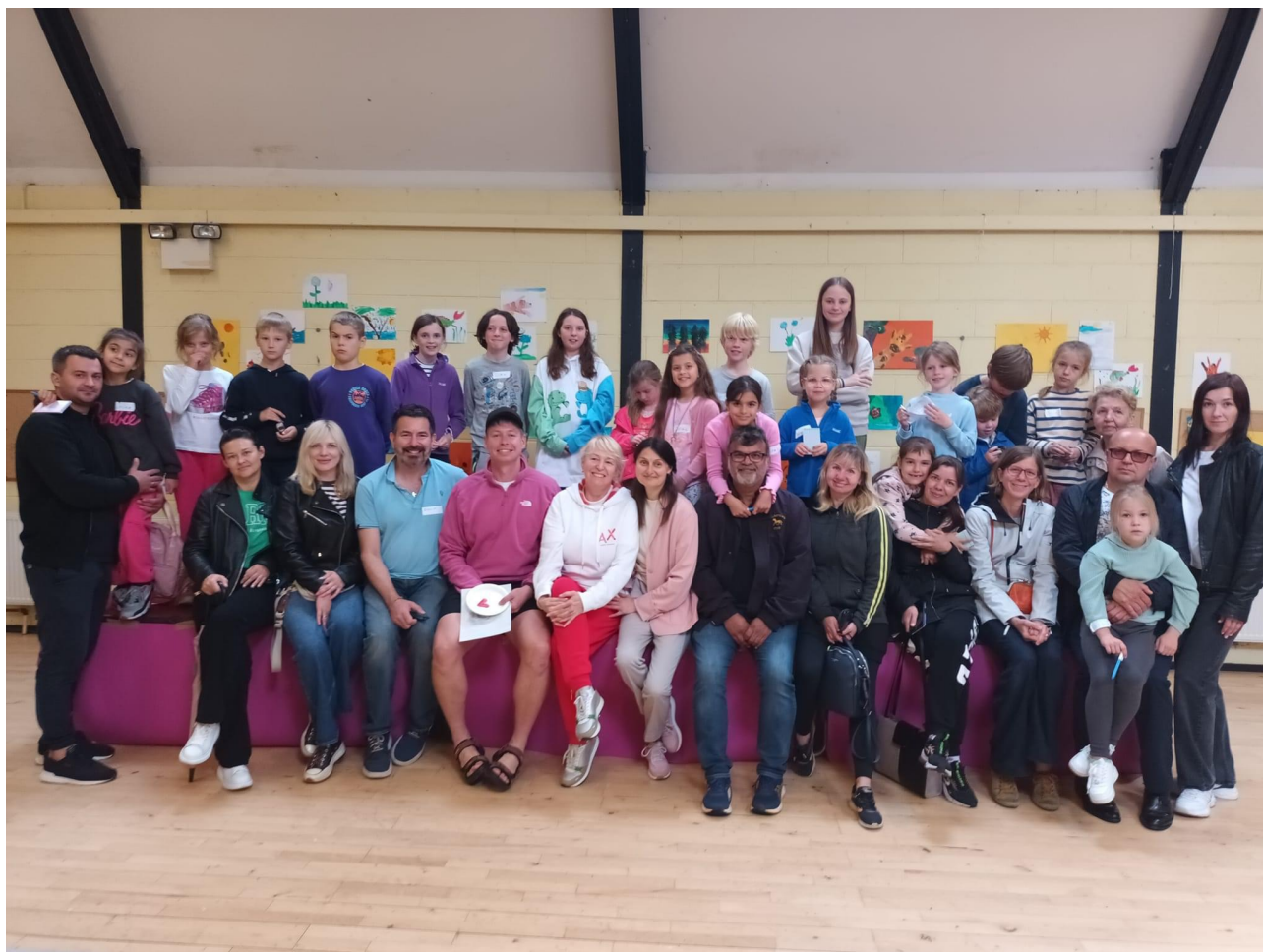
Final Day of St Mary's Howth our Fabulous Kids Music, Art and Yoga School.