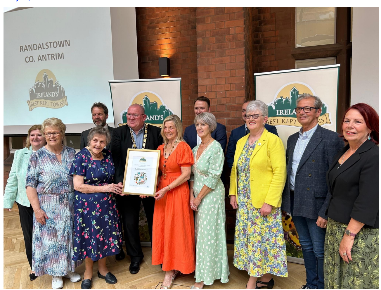
July 3, 2024