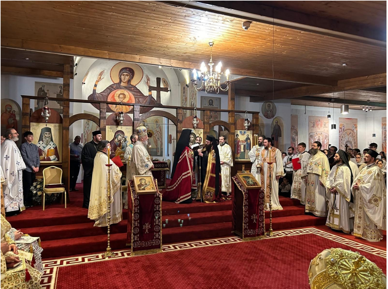
Image of the day – First Romanian Orthodox Bishop of New Diocese of Ireland and Iceland enthroned