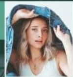
Rock Choir Ballyhackamore & Hollywood