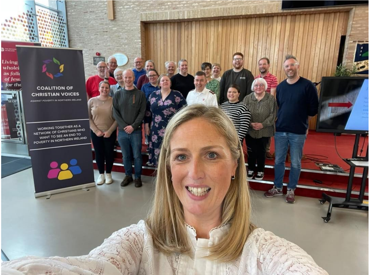
Image of the day – Coalition of Christian Voices against poverty in Northern Ireland