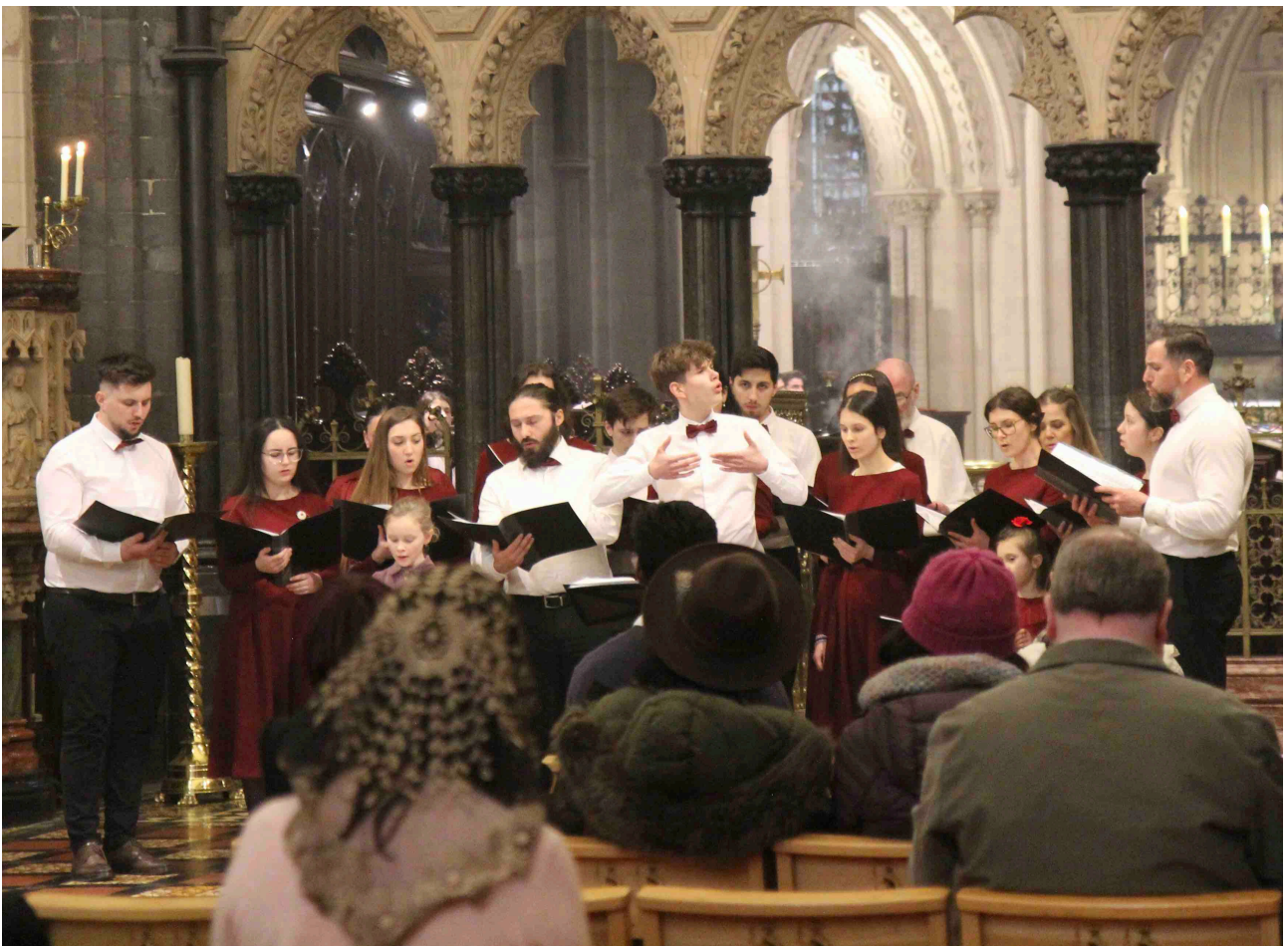
The Choir of the Dublin Romanian Church.