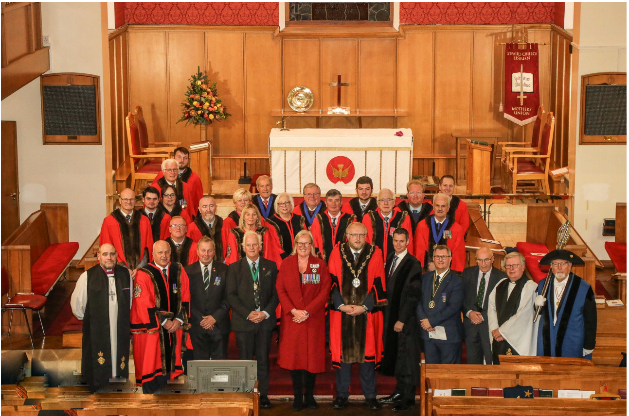
Mayor, councillors, Rector (left), RBL Chaplain (right) and Greenfinch representative

inspiration to young women today who are thinking of joining the services and indeed helped shape the inclusive Armed Forces that exist today.