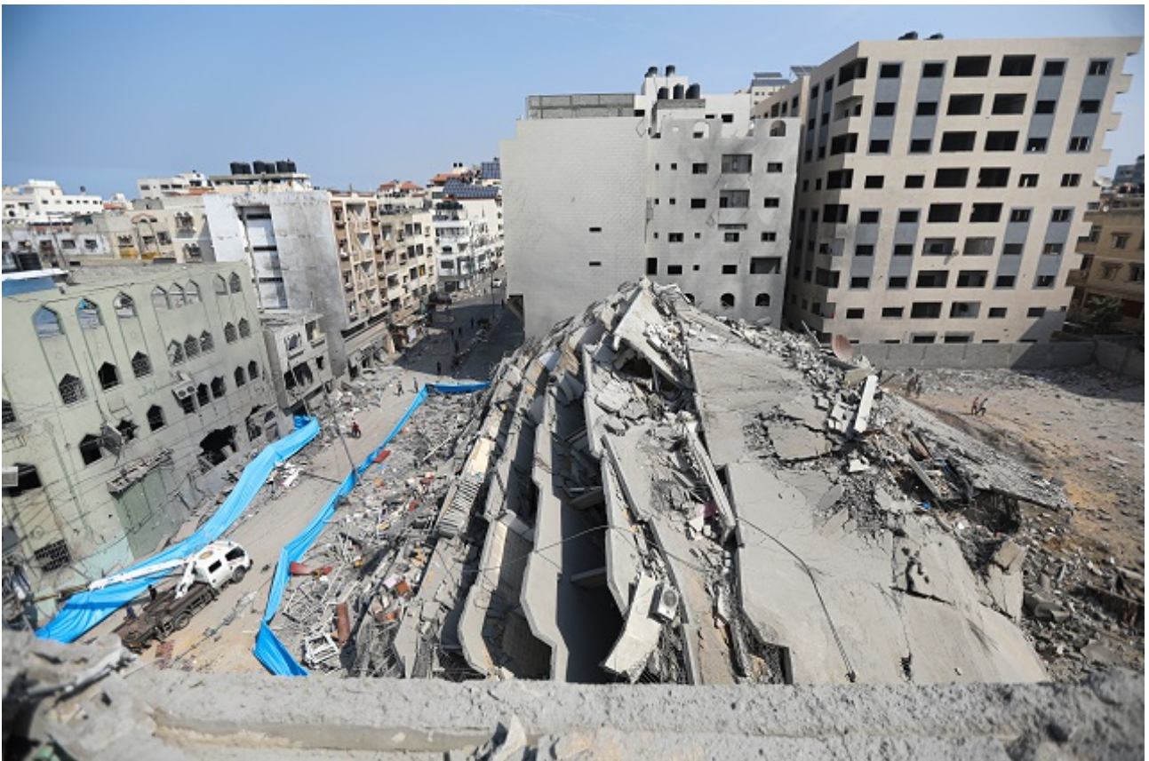
Image of the day – C of I Appeal to ‘Shine a Light for Diocese of Jerusalem’