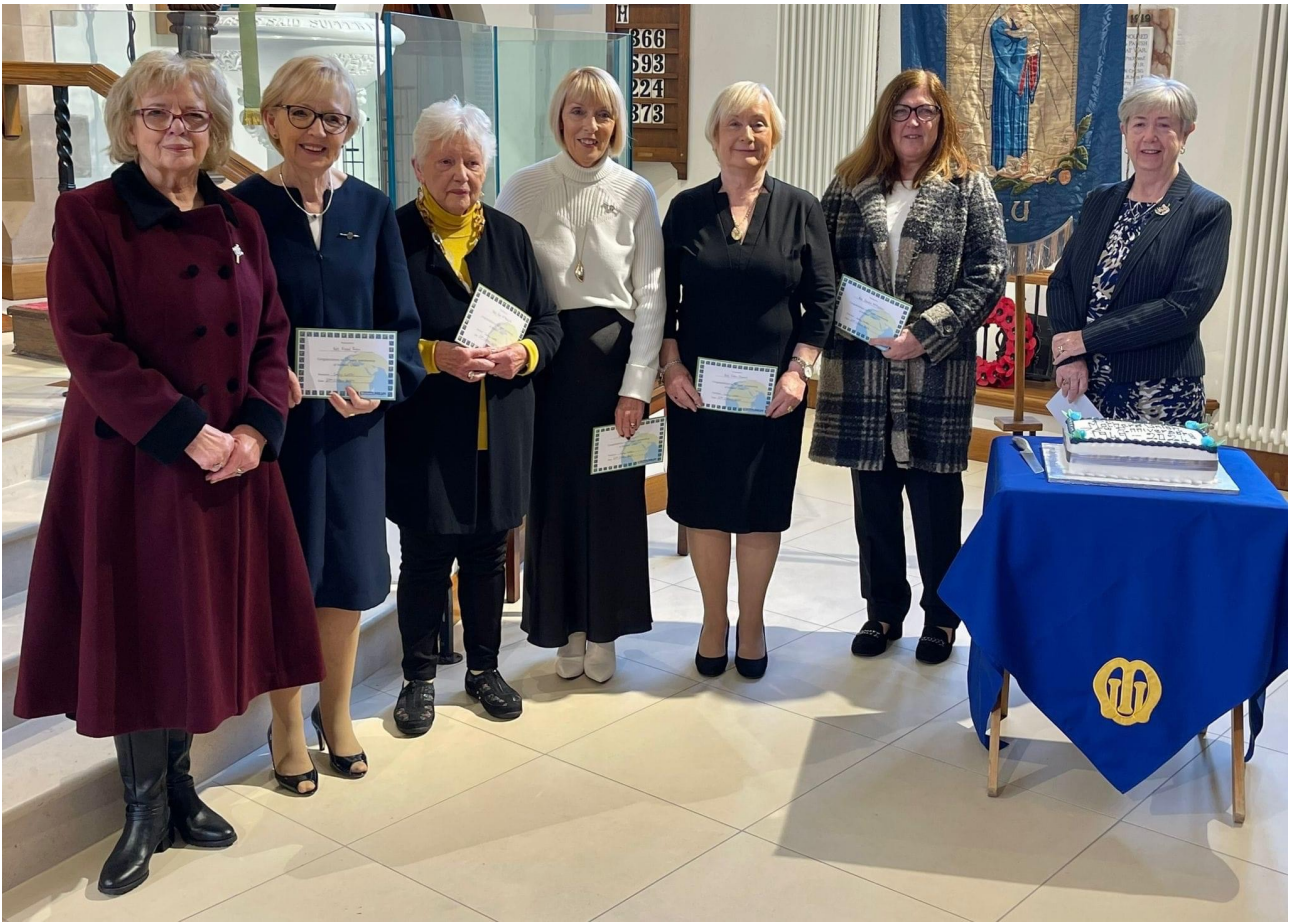
Representatives from Connor Diocesan MU office-bearers with leaders of Dunmurry branch.