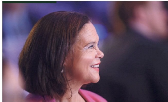
Sinn Féin president Mary Lou McDonald at the Ireland's Future event in Belfast yesterday

Ms McDonald said she agreed with Taoiseach Leo Varadkar, who said yesterday said Israel was not acting in self-defence. During a visit to South Korea, he said Israel's action in Gaza "isn't just self-defence, it resembles something more approaching revenge".