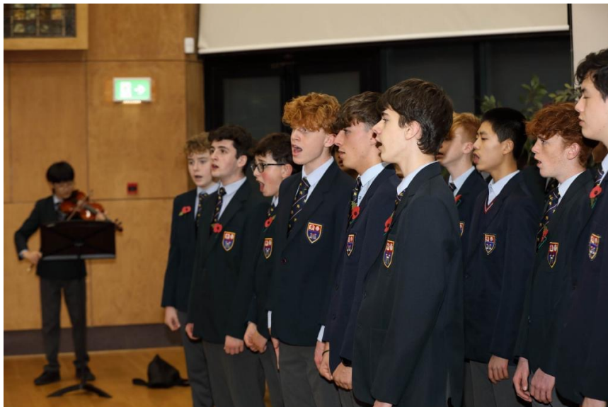
Fortitude: Wesley College Male Voice Choir