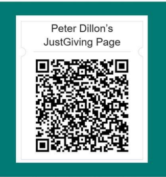
Scan QR Code to Donate today!

Raising awareness and funding, to help towards building toilet blocks