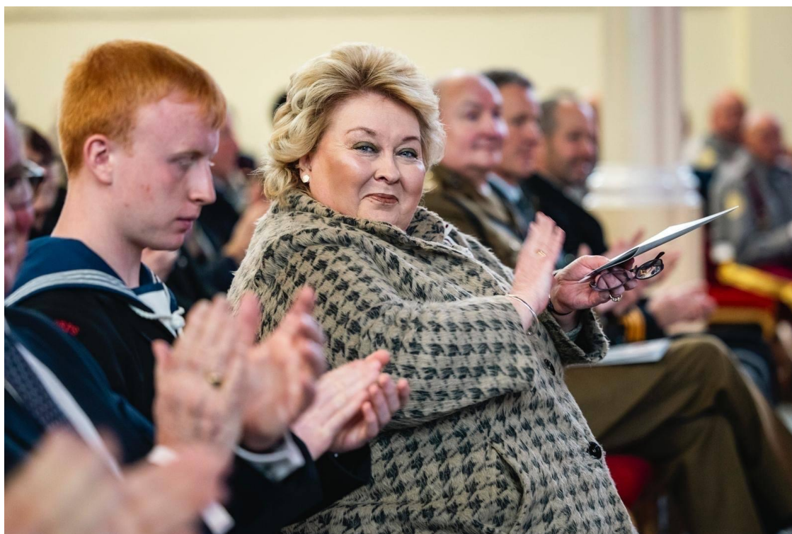
His Majesty's Lord Lieutenant for Belfast