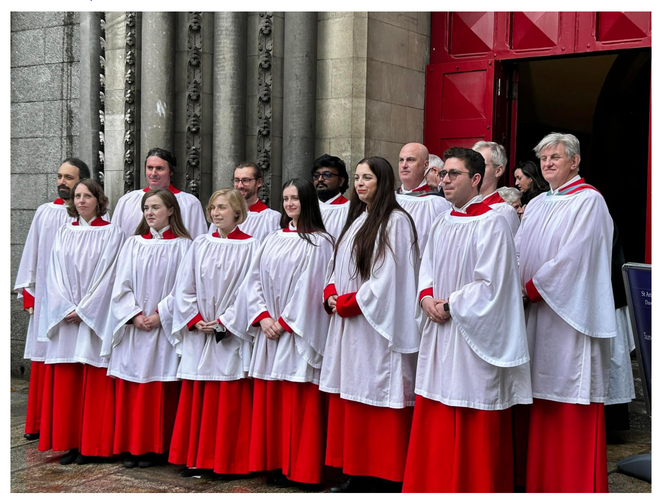
The Choir of St Ann's Church, Dawson Street, Dublin which sang at the major commemorative service this week.

vandalism and anti-social behaviour and improve safety and security.