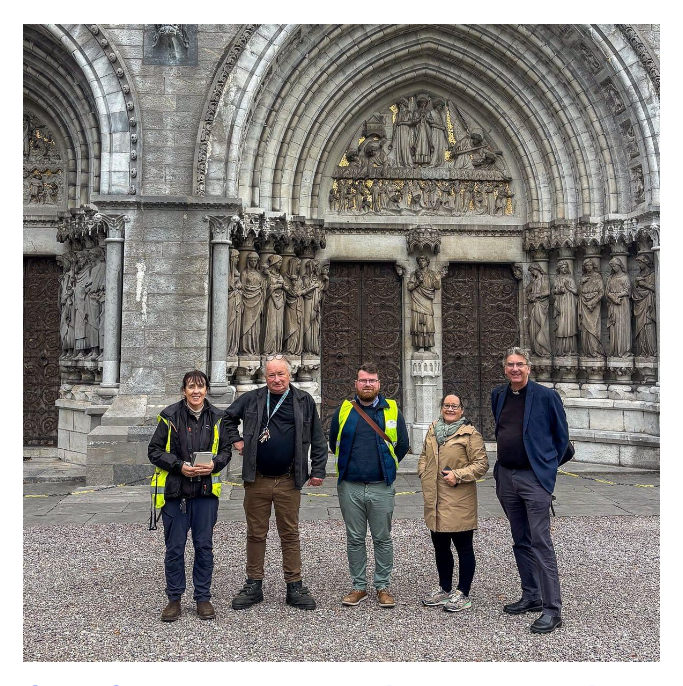
Cork Cathedral's extensive conservation work

Photo above - Evensong with the combined choirs of HM Chapels Royal St James's Palace and Hampton Court Palace. Photograph on the King's Staircase, Hampton Court.