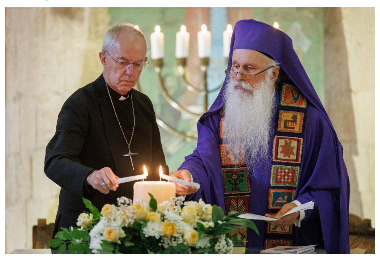
d Church projects that provide support to those displaced by conflict.

Archbishop Welby's visit to the South Caucasus began in Azerbaijan, where he discussed peace and reconciliation with political leaders. He also spoke of the need for the resumption of negotiations to secure a lasting settlement between Azerbaijan and Armenia that recognises the sovereignty and territorial integrity of both countries.