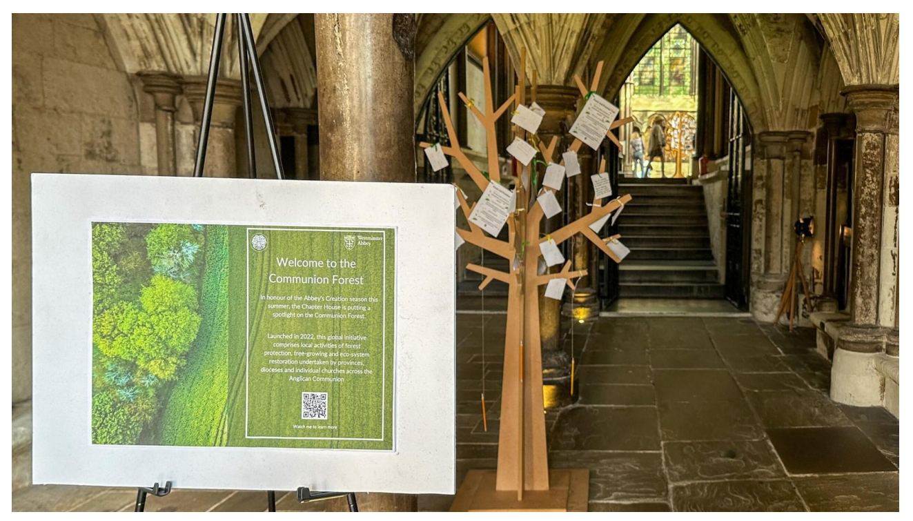
September 21, 2024

Forest to preserve it. Embark on a journey of stewardship, renewal and faith at the Communion Forest exhibition, where the Anglican Communion's commitment to environmental conservation comes to life.