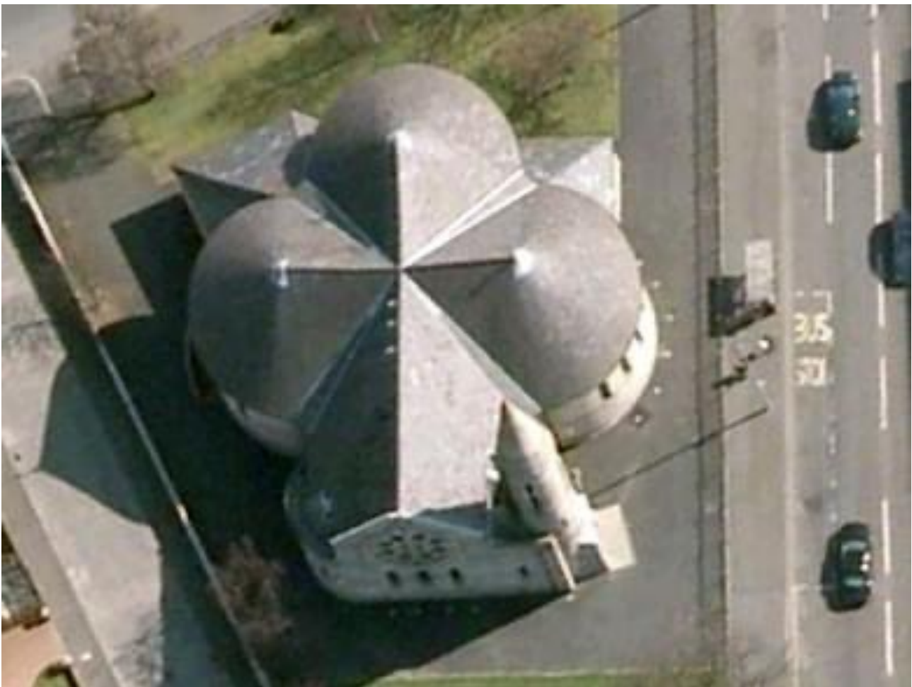
St Matthew's Church, Shankill, Belfast from above where the distinctive shamrock shape is readily identifiable

In addition, as also recommended by the Executive Committee and the Trustee, the Standing Committee set the rate of levy to be paid by each diocese towards the cost of securing the solvency of the Clergy Pensions Fund from 1st January 2025, at the unchanged percentage rate of 3% of the Minimum Approved Stipend in force on that date.