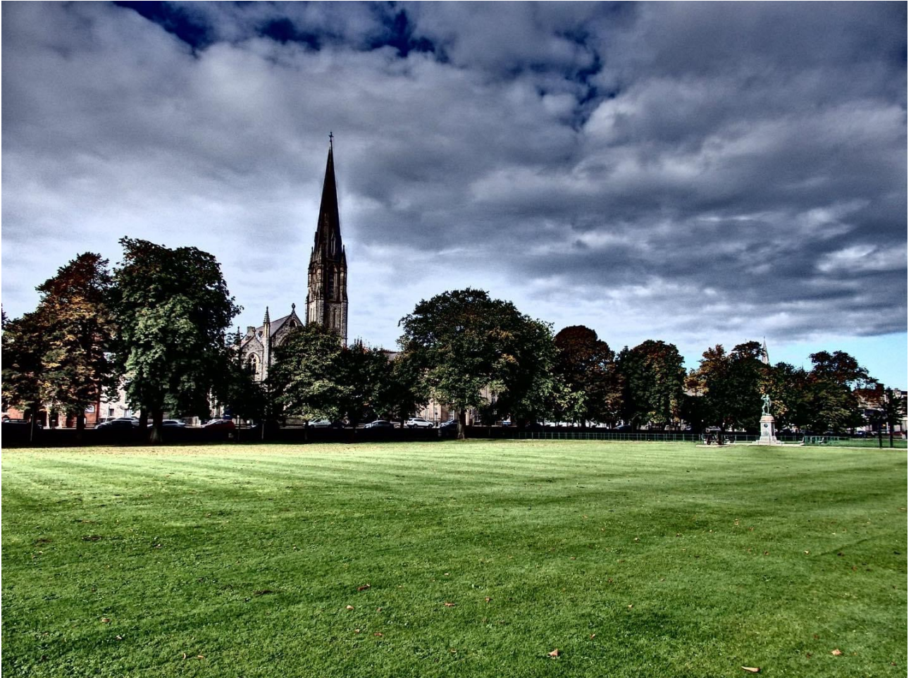
Image of the day - Armagh Presbyterian Heritage