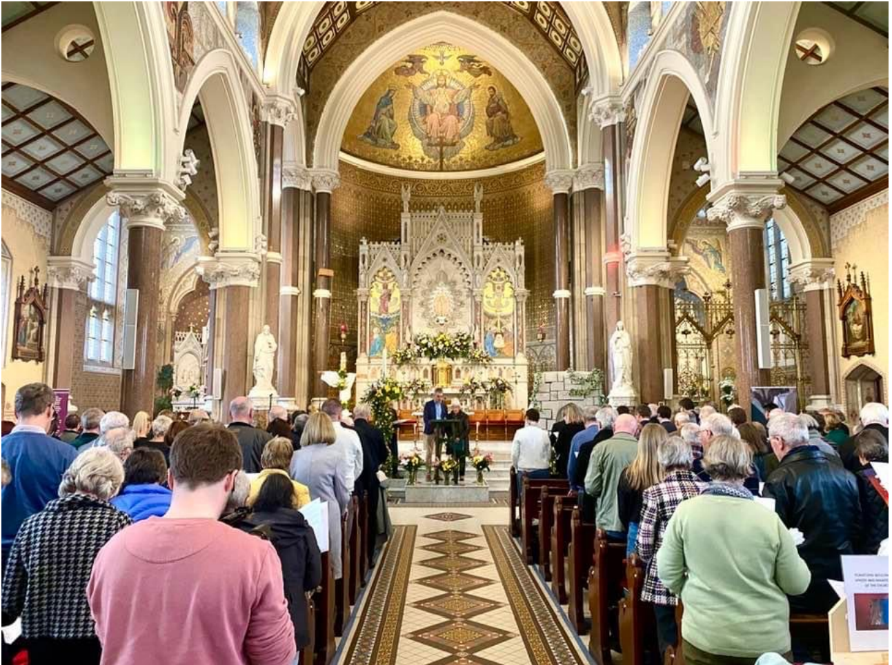
Image of the day – Corrymeela at Clonard Good Friday Agreement recommitment