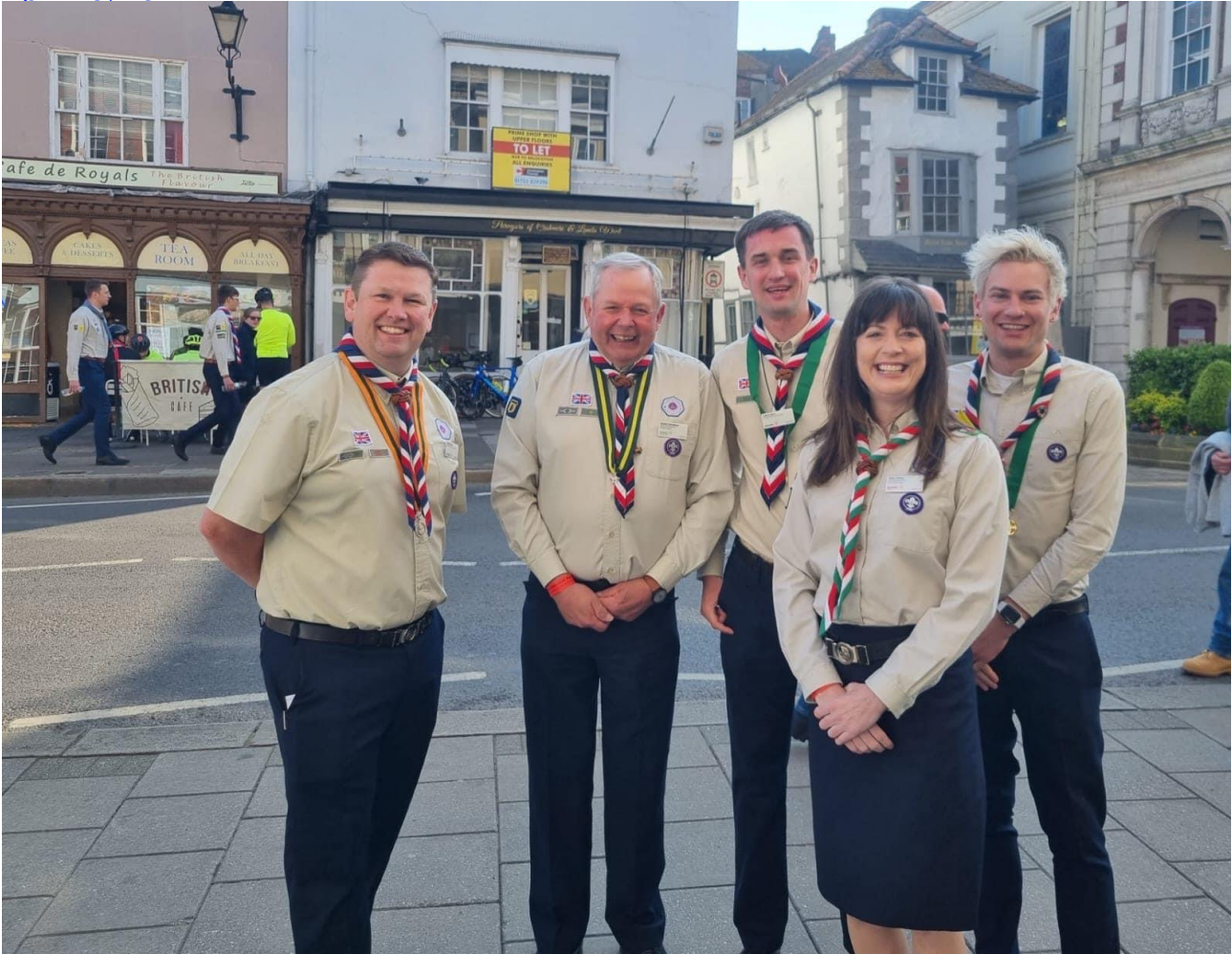
Photo above - some members of the Northern Ireland contingent at the annual Scout service at St George's Windsor