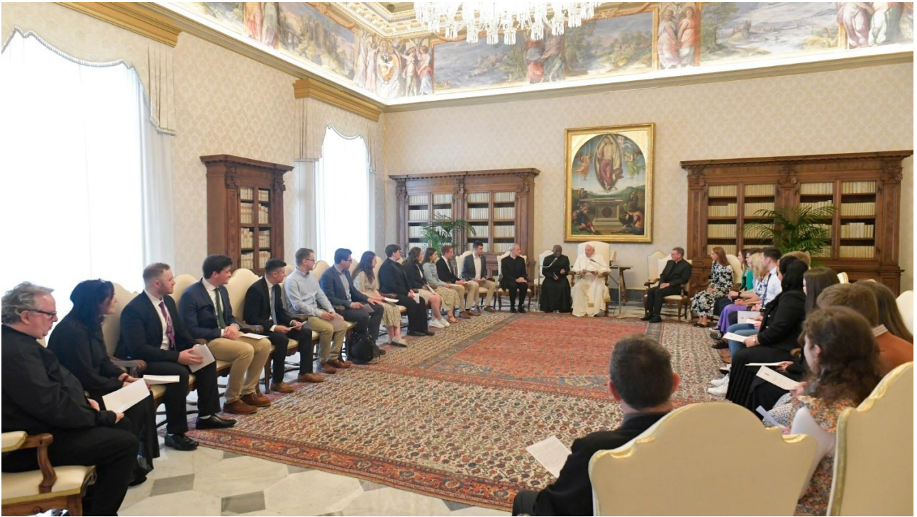
Image of the day – Pope Francis receives Queen's University chaplaincy students