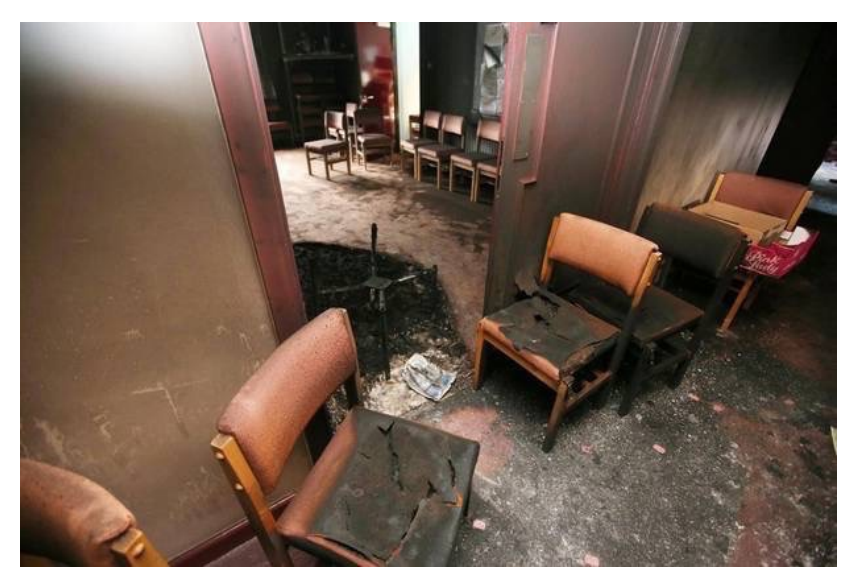
Arson attack on Cairsnhilll Methodist Church in south Belfast leaves sever damaged to the building.

"Two Fire Appliances from Central Fire Station were deployed to the scene of a small fire in the entrance lobby of the church. Two firefighters using a hosereel jet extinguished the fire and Northern Ireland Fire & Rescue Service finished at the scene at 11:27am.