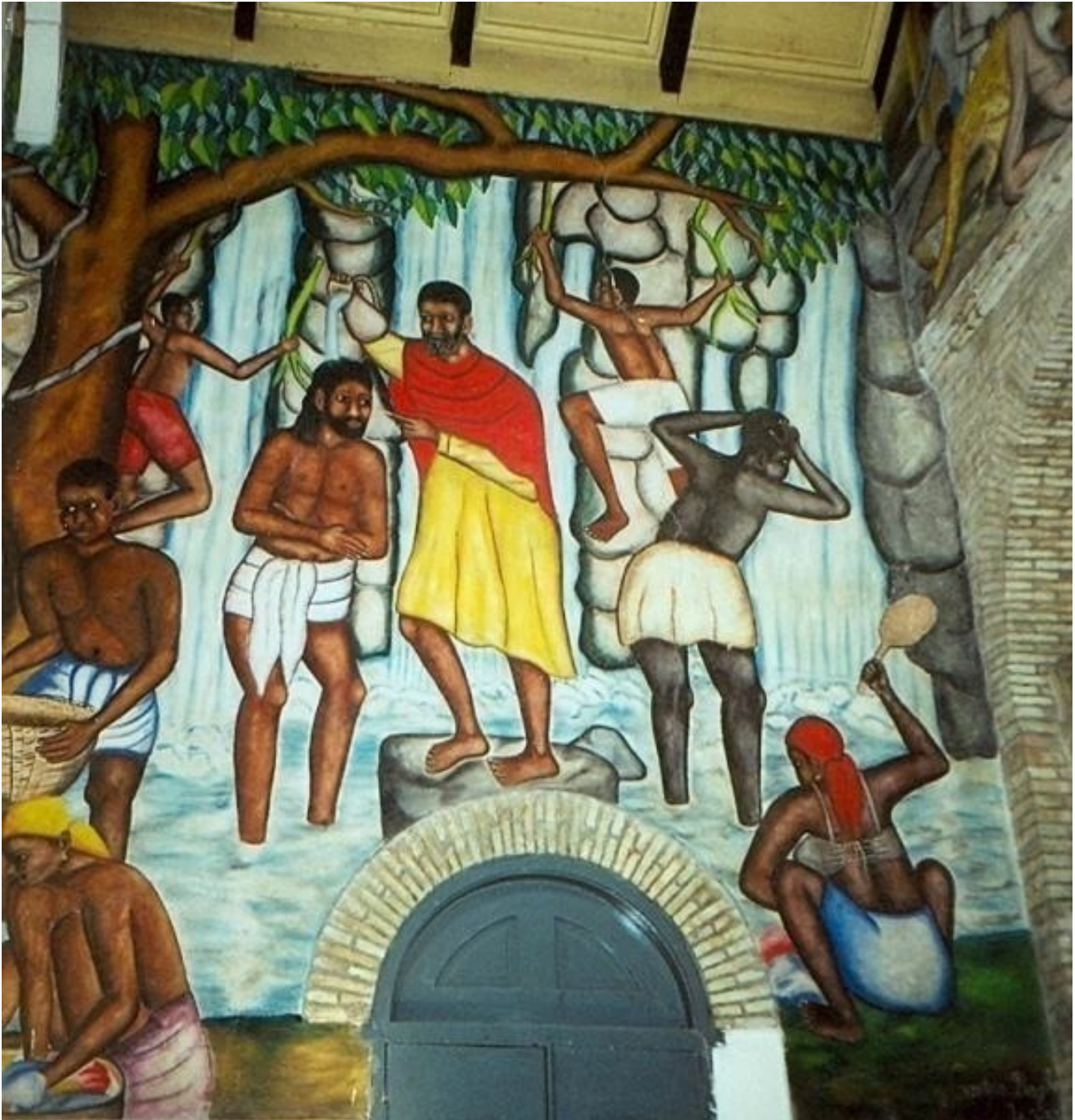
The Baptism of Our Lord painted by Casera Bazile 1951

On January 12, 2010, a massive earthquake struck Haiti, killing more than 300,000 people, seriously injuring more than 250,000, and leaving 1.3 million homeless. An extensive number of private and public buildings were destroyed including Holy Trinity Cathedral and the affiliated Episcopal institutions in the Cathedral Complex.