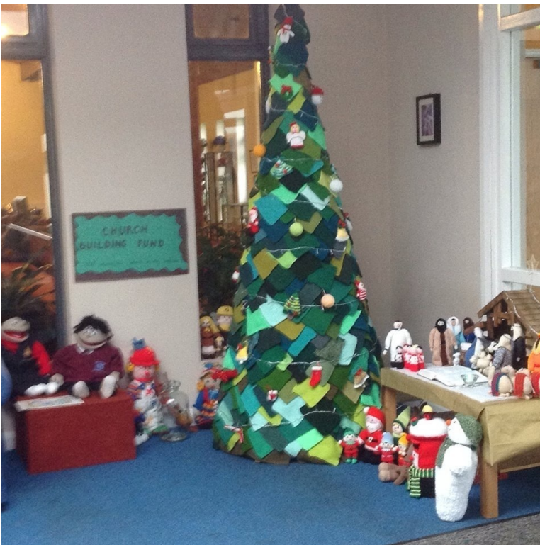
Christmas tree made of knitted squares