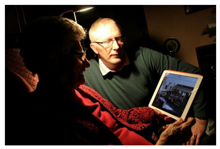
A couple from St Andrew's Arbroath, Scotland stream a church service online

The online platform is already in use by some congregations, whereby the traditional church service is streamed live online. Now the Church of Scotland expects its largest online audiences for live-streamed services on the 25 December.