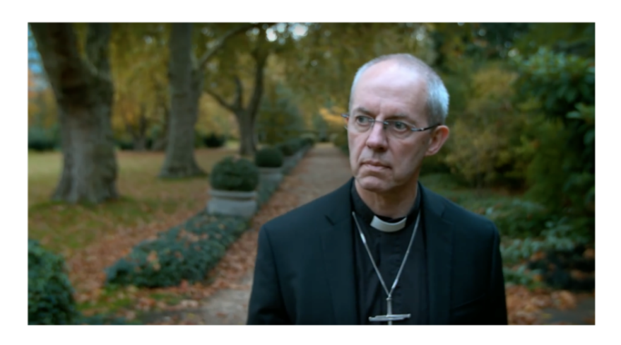
The Archbishop of Canterbury has released his annual Christmas Letter to churches across the world

Church and the call to live in hope as Christians serve the most needy.