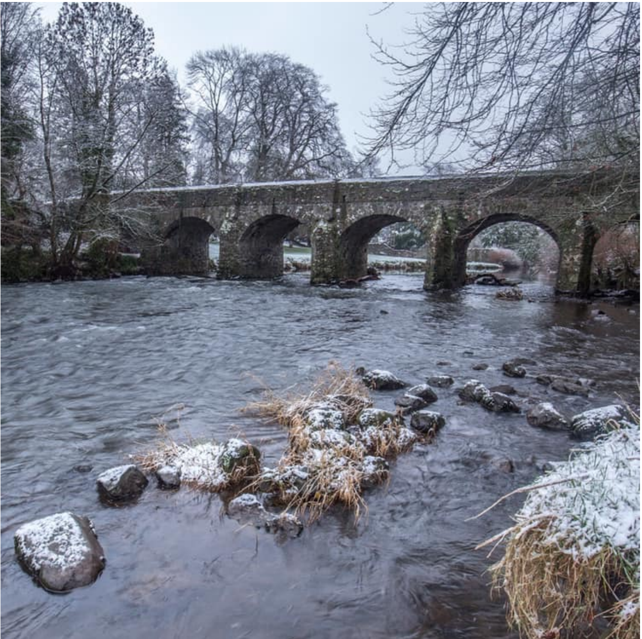
Image of the day - bridge on Sixmile River