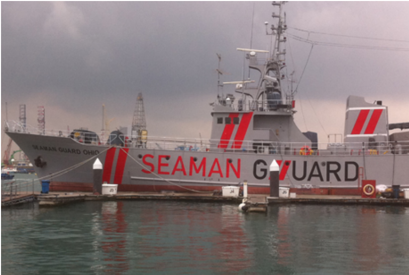
The MV Seaman Guard Ohio at Singapore in July 2012

properly from the very real risk of pirate attacks and hijack. The men have already suffered so much so this is a terrible outcome. It is beyond belief.”