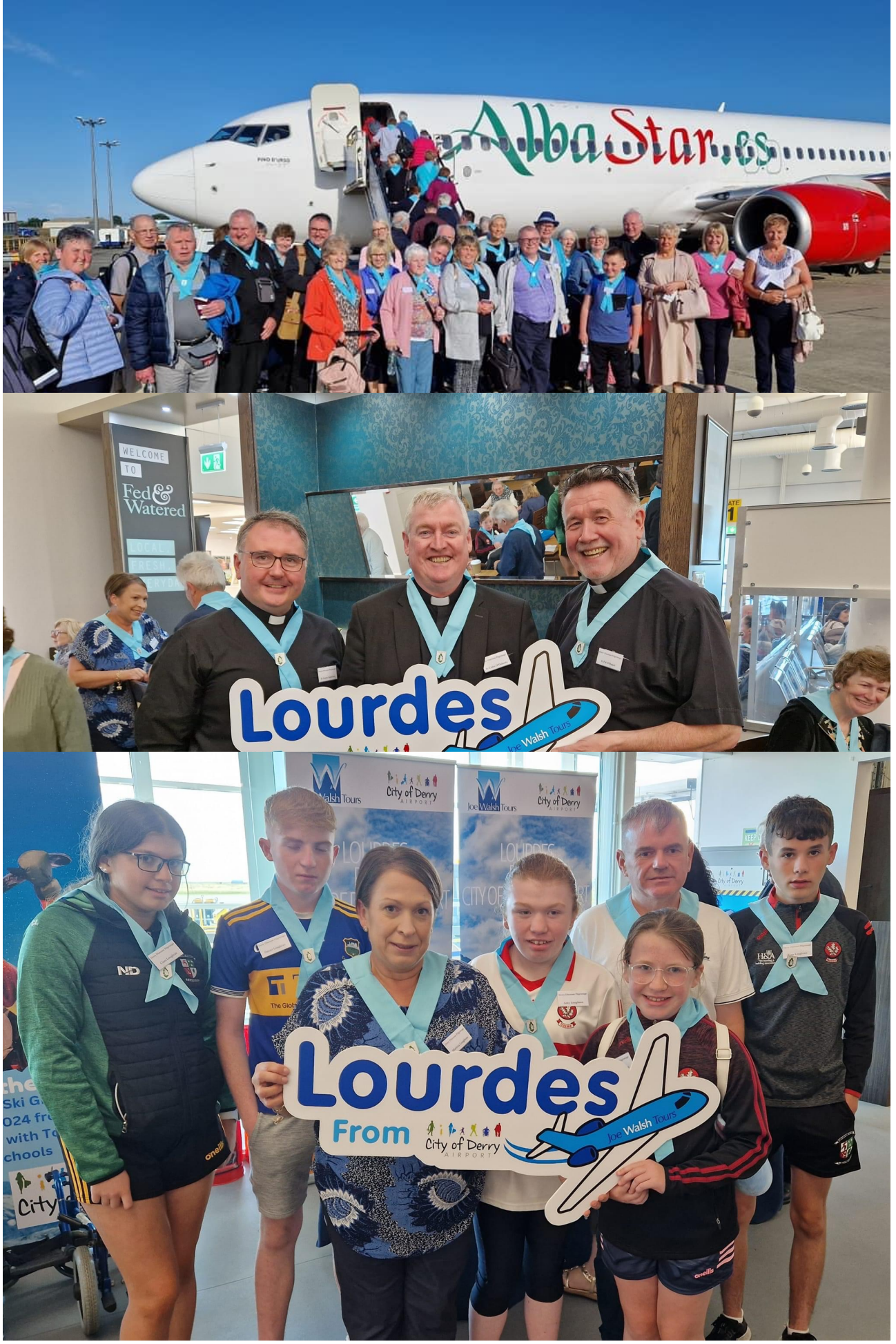
Church News Ireland