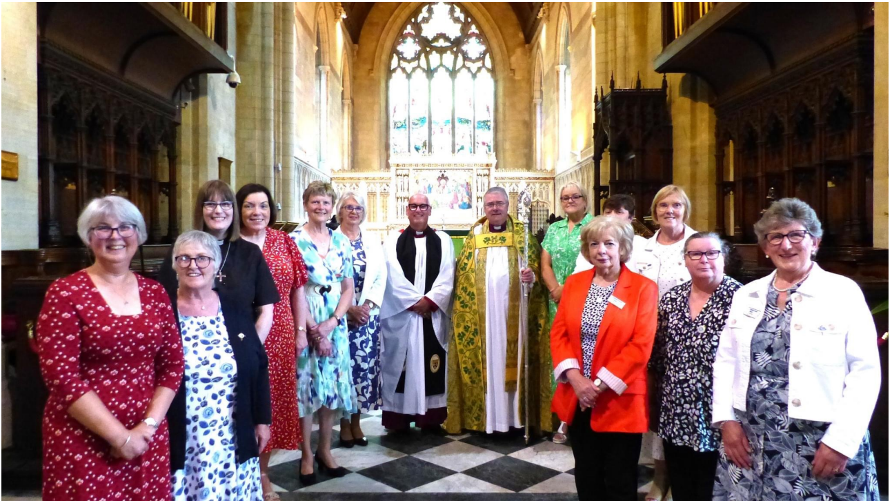
Image of the day – New Mothers’ Union All Ireland Chaplain commissioned