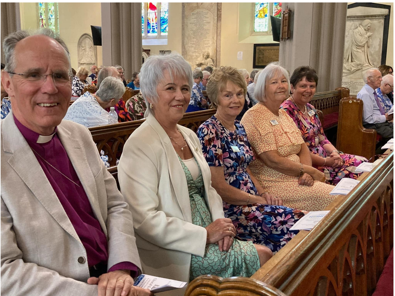
The Bishop of Clogher accompanied his Diocesan President