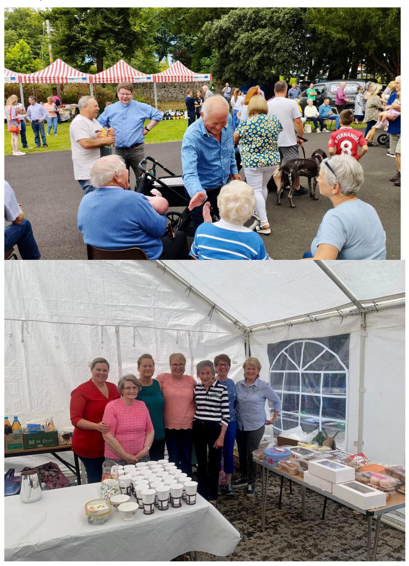
The volunteer team of organisers certainly worked hard before, during and after the event Church News Ireland