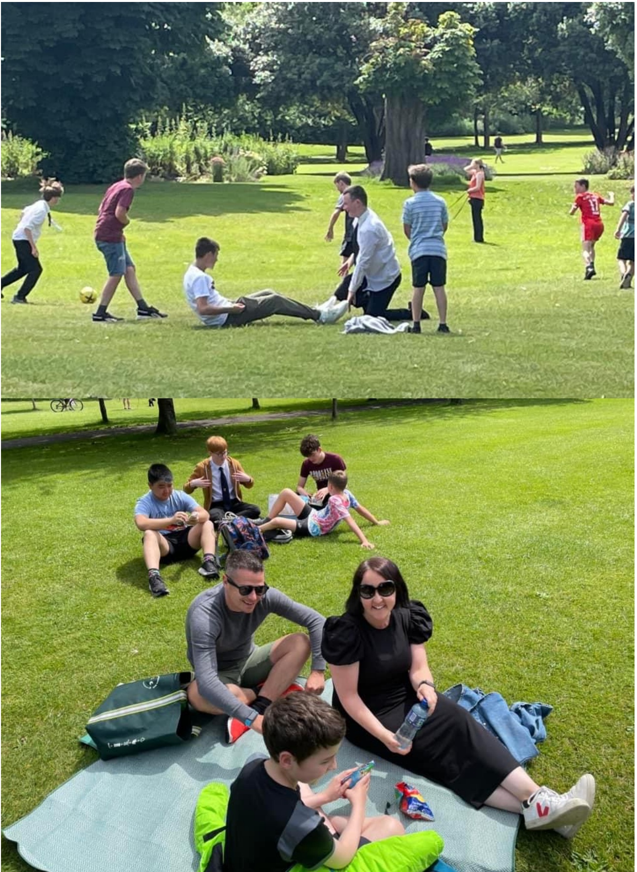
Bartholomew's Parish Church and a picnic which included parents and friends.