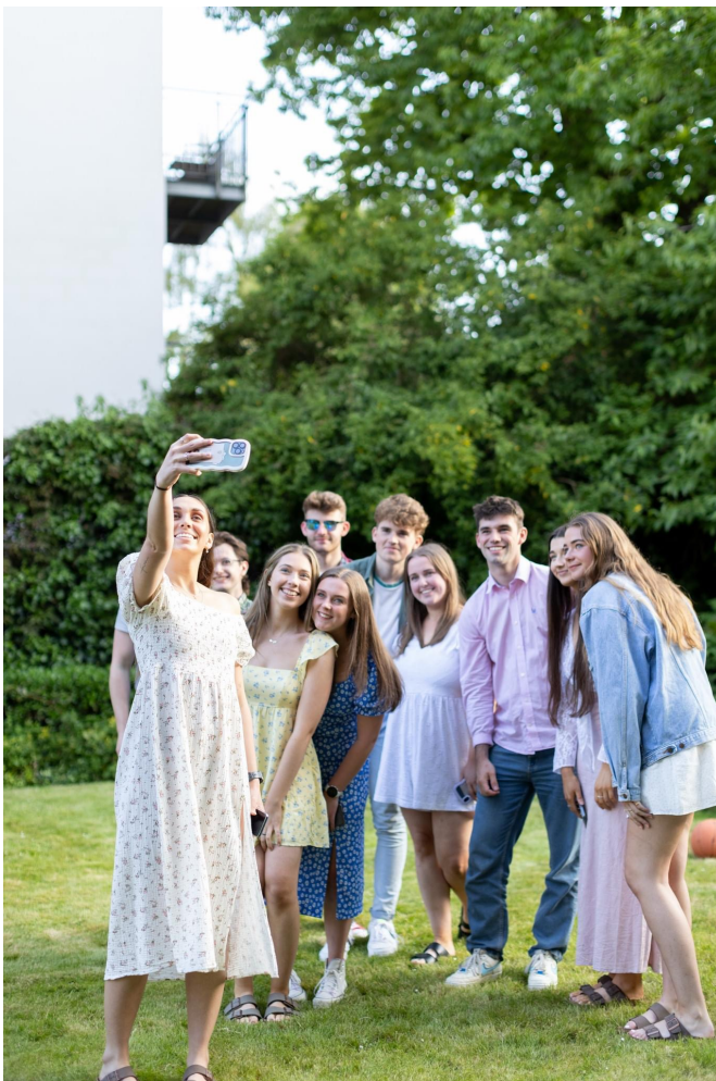
Church News Ireland

Christian Aid Week has been running in Northern Ireland since 1957, making it the region’s longest running fundraising campaign. Each year, thousands of people donate to support people living in some of the poorest countries in the world as well as countries coping with conflict, drought, risk of famine and the impacts of climate change.