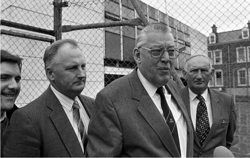
Ian Paisley, pictured in 1988 outside Lisburn courthouse

Mr Hurd felt that the "intemperate tone of Dr Paisley's attack sat oddly with his professed readiness to have constructive discussion with other party leaders".