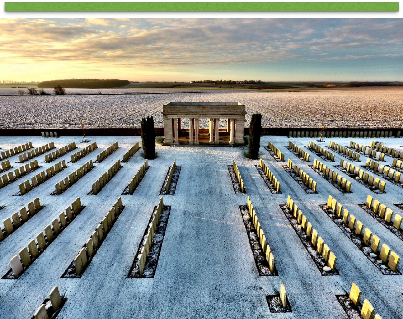
Image of the day - War graves on the Somme in winter