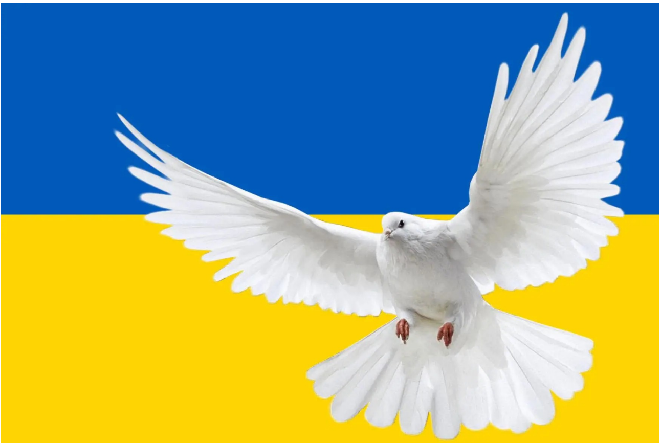
Image of the day – A Good Friday Concert for Ukraine, St Patrick’s Cathedral, Dublin